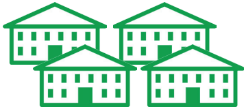
New Casis, Govalle, Menchaca and T.A. Brown Elementaries, and New Southwest Elementary