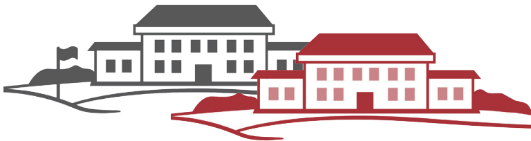
New Rosedale School and New Eastside Memorial Early College High School at original L.C. Anderson Campus