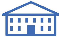
New Northeast Austin Middle School