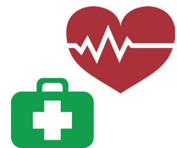
New LBJ ECHS Medical High School