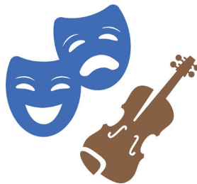
Renovations to Fine Arts Areas