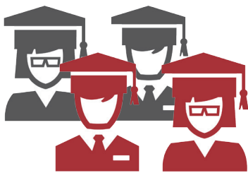
Early College High Schools

3. Reinvention programs for 21st-century learning would include: